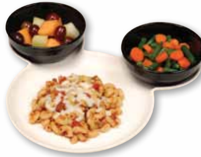
Meaty Macaroni Ground Turkey with Marinara Sauce topped with Mozzarella served with Veggies and Fruit Salad