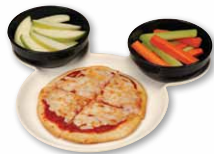
Cheese Pizza served with Veggies and Sliced Apples