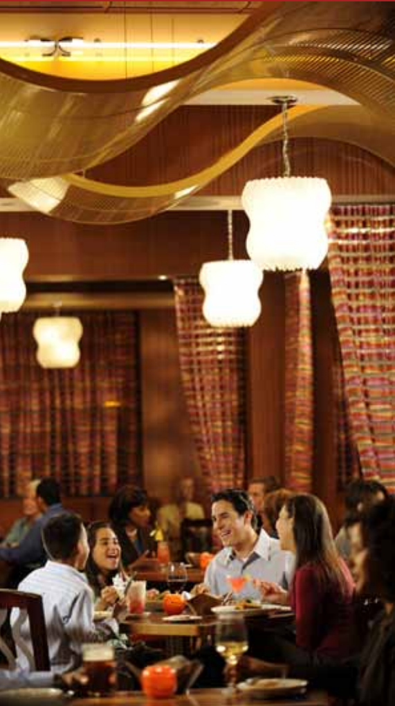
The Wave at Disney's Contemporary Resort