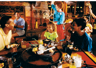
Table Service Meals

You may redeem your snacks at most Quick Service restaurants, outdoor food carts and merchandise locations selling frozen ice-cream novelties, popcorn or Coca-Cola ® products throughout the Walt Disney World ® Resort. Look for this symbol to identify Quick Service restaurants, outdoor food carts and select merchandise locations that accept your Disney Deluxe Dining Plan and to identify eligible snack options.